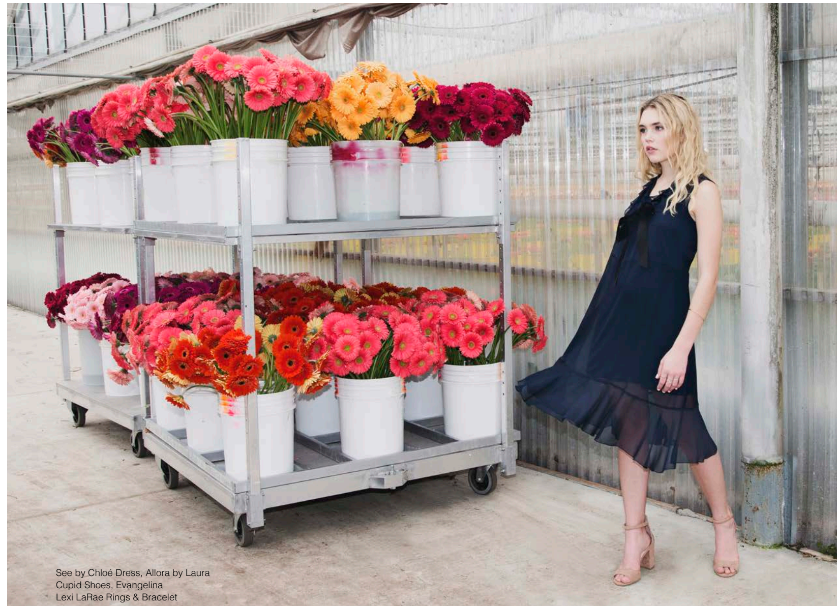
See by Chloé Dress, Allora by Laura Cupid Shoes, Evangelina Lexi LaRae Rings & Bracelet