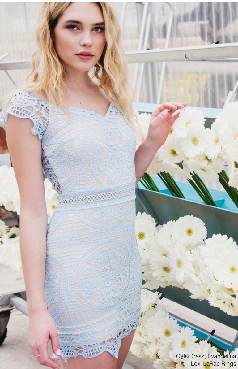
Calis Dress, Evangelina Lexi LaRae Rings