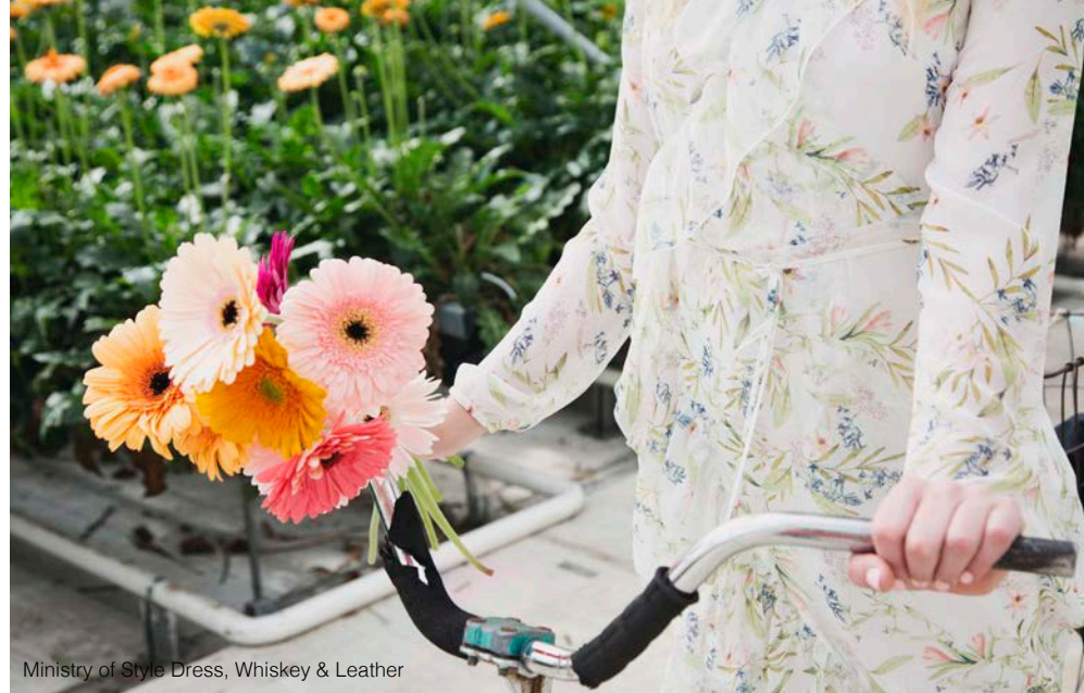
Ministry of Style Dress, Whiskey & Leather